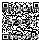
Scan for CBS58 segment