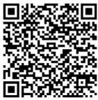
Scan for Journal Sentinel article